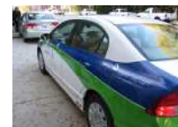
CNG car on display at Commission

ent including a ten per cent administration fee.