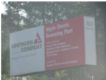
Entrance to Georgia Power's Plant Vogtle