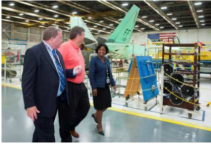
Commissioner Stan Wise takes a tour of the Lockheed Plant with Lockheed officials